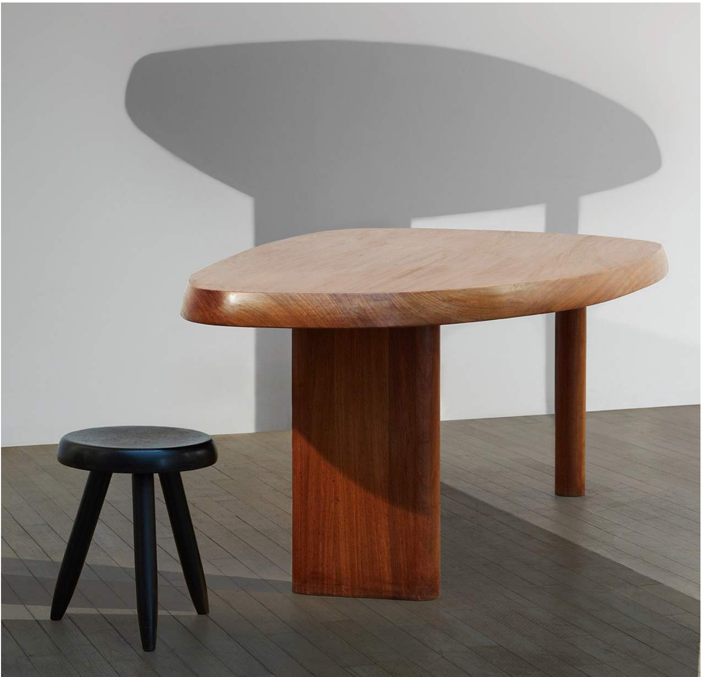
Charlotte Perriand (1903 - 1999), Table « Forme Libre », 1960