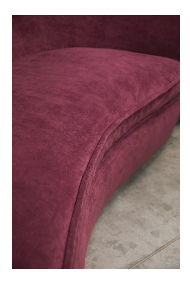
Curved sofa re-upholstered with red velvet, 5 cylindrical oak legs H. 28,7 x L. 92,9 x W. 48 in.

Jean Royère (1902-1981) "Polar bear" sofa, Ca. 1947