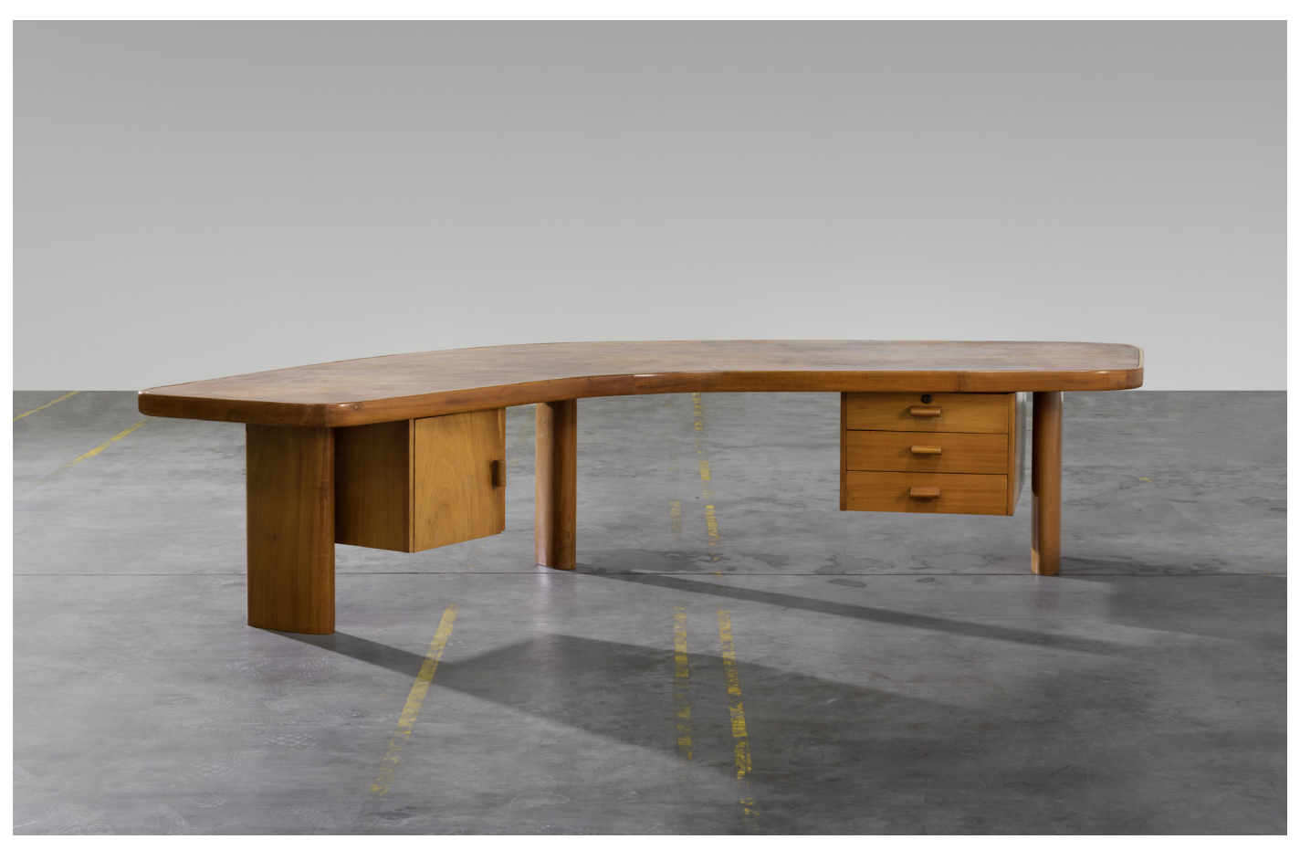
In cherrywood, curved top sheated by tawny leather resting on three ovoïd legs, storage with three drawers to the right and storage to the left.