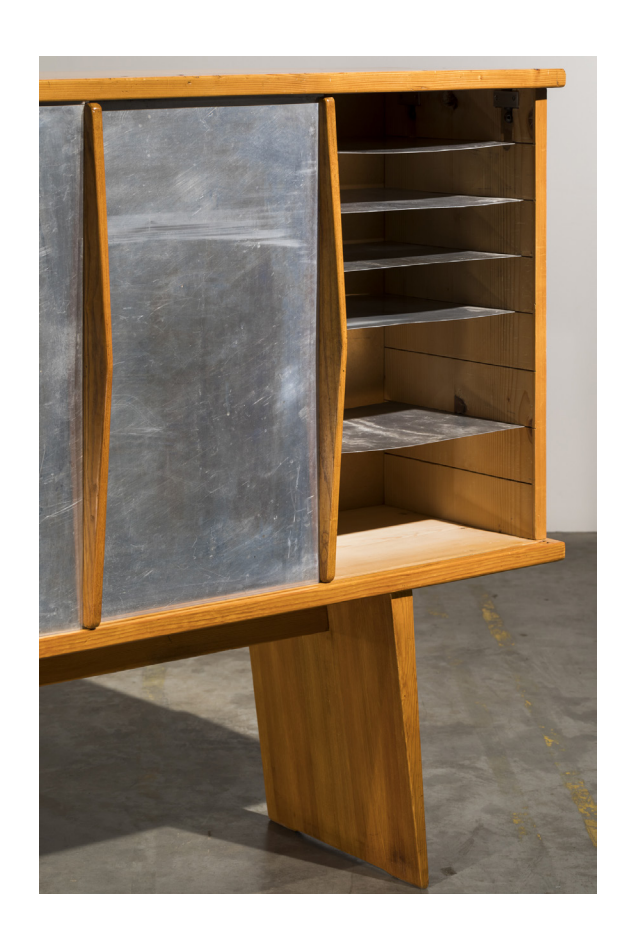
Rectangular sideboard in pinewood, three sliding aluminium doors opening on the front H. 30 x W. 96 x D. 18 in.