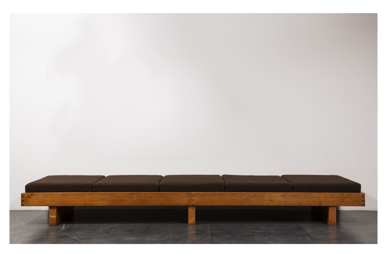
Sitting composed of a larch top resting on three crosspieces, brown wool square cushions H. 17.7 x L. 146.8 x W. 33.8 in.

Charlotte Perriand (1903-1999) Five-seater Bench, 1968