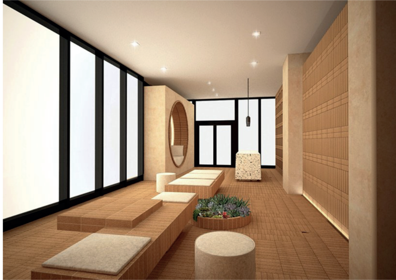
earth lounge by fanny haim & associates

CASACOR miami — the architecture, interior and landscaping design exhibition in north america — returns for its third year at miami's $1.05 billion landmark, brickell city centre. in partnership with swire properties , presented by cosentino and with the global sponsorship of deca, the interior design exhibition will feature an international mix of 20 established and emerging interior designers, inspired by sustainability and the urban infrastructure of the city. visitors will move from micro-environments to vignettes within a 25,000 square foot residential sales gallery. visionaries, such as moniomi design, allan malouf, pininfarina, jesús pacheco studio, edge collections, alberto salaberri, and léo shehtman return to CASACOR miami. this year, the three-week exhibition continues to add new top-tier designers to its impressive roster, such as ukraine's rising design firm yodezeen, and sig bergamin and michelle haim from design firm fanny haim & associates.