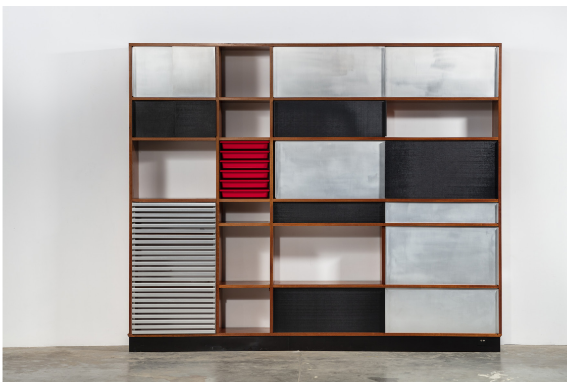
Unique cabinet, ca. 1968, wood, aluminum, plastic H. 106,2 x L. 118,1 x D. 11,8 in. Galerie Steph Simon edition Provenance : Special commission from Galerie Steph Simon, Paris. Thence by descent