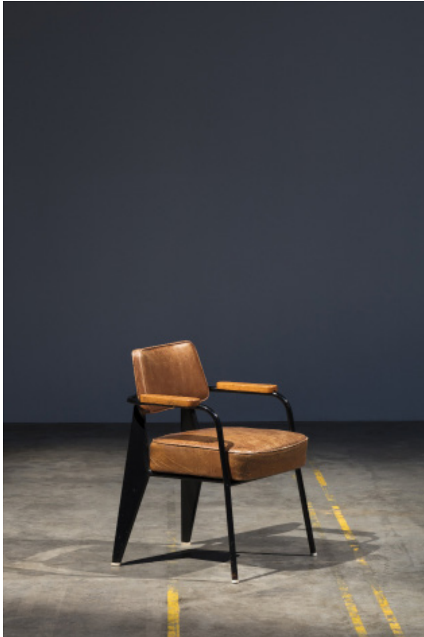
"Bridge Direction" armchair , ca. 1950, black lacquered bent steel structure with four legs, seat and backrest upholstered with original cognac leatherette, two wooden armrests H. 31,4 x L. 23,2 x D. 20,8 in.