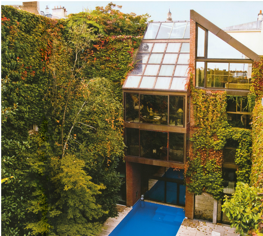
Inner courtyard of his house