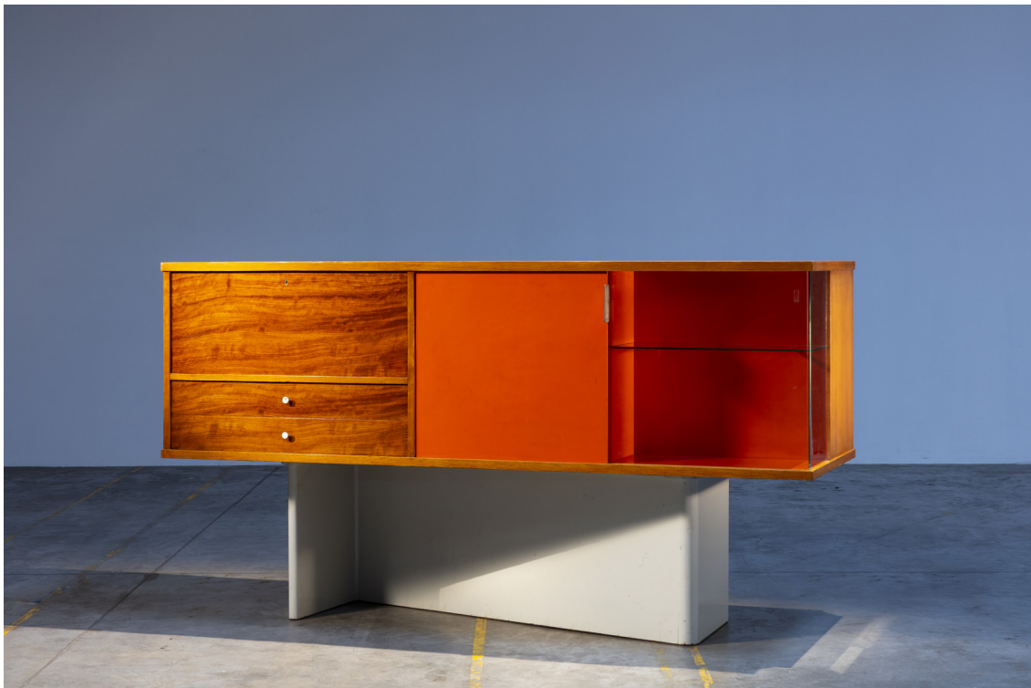
Double-sided sideboard, ca. 1950, wood, steel, glass H. 27.5 x L. 92.5 x D. 31.8 in., labeled "Dumond"