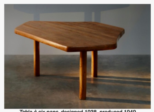
Table à six pans, designed 1938, produced 1949

Also featured in the exhibition is an extremely rare six-sided table called Table à six pans (1949), based on the design of Perriand's first wooden table, which she made in 1938 for her apartment in Montparnasse. Its organic and unorthodox shape was engineered to maximize the number of people who could sit comfortably around it. The piece signaled a shift in Perriand's career: she started crafting wooden tables whose silhouettes delineated unexpected shapes, and she began working in earnest with furniture that she termed "en forme."