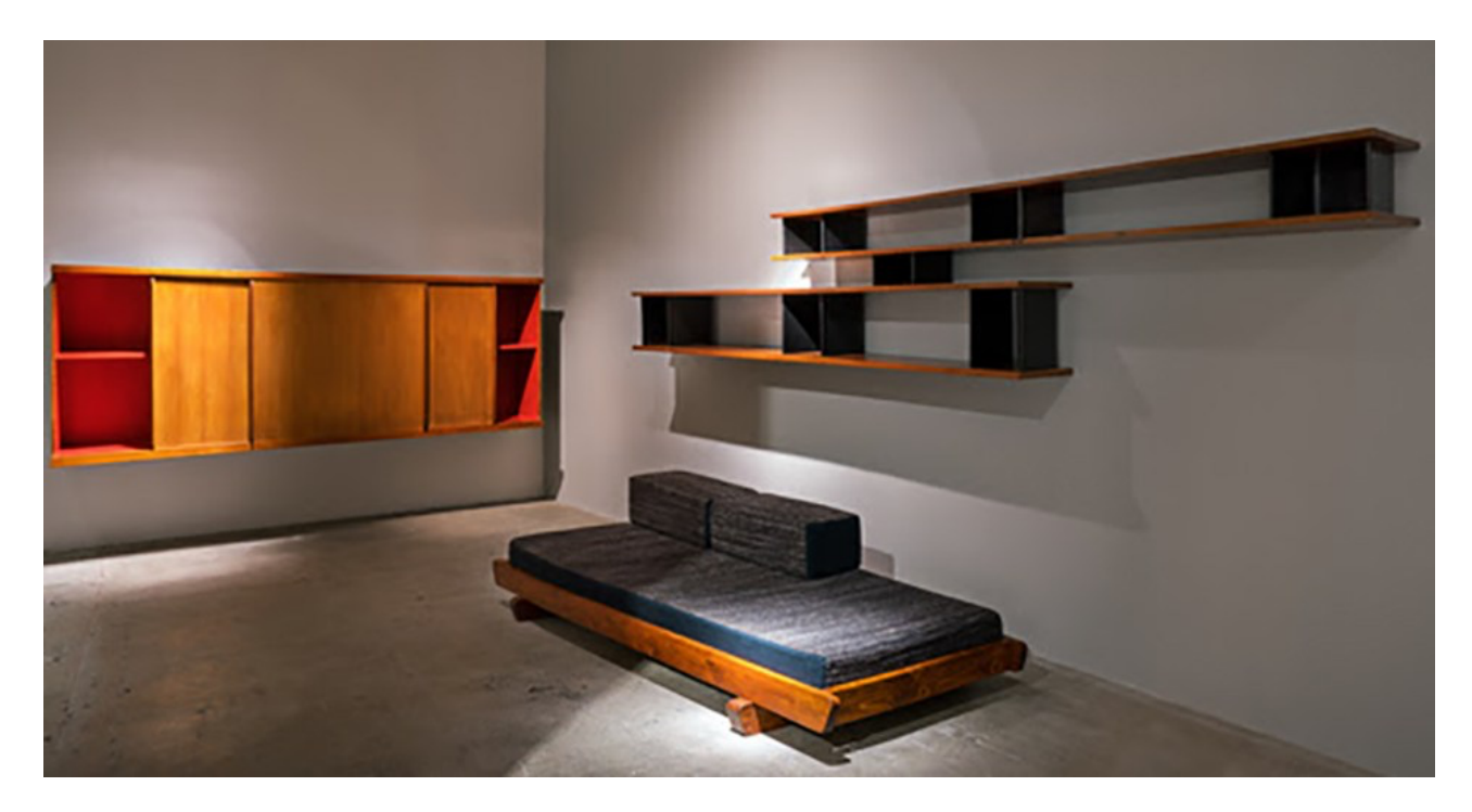
Charlotte Perriand exhibition, Venus Over Manhattan

Also featured in the exhibition is an extremely rare six-sided table called Table à six pans (1949), based on the design of Perriand's first wooden table, which she made in 1938 for her apartment in Montparnasse. Its organic and unorthodox shape was engineered to maximize the number of people who could sit comfortably around it. The piece signaled a shift in Perriand's career: she started crafting wooden tables whose silhouettes delineated unexpected shapes, and she began working in earnest with furniture that she termed "en forme."