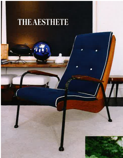
LAFFANOUR'S LIVING WITH CHARLOTTE PERRIAND BOOK (ON A LE CORBUSIER/PIERRE JEANNERET TREE TRUNK COFFEE TABLE)