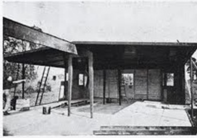
2. POSE DES ELEMENTS DE COUVERTURE