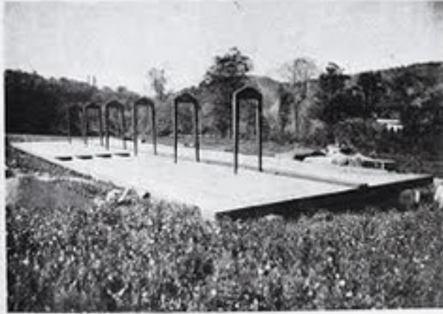
1. PLANCHER ET CHEVALETS

APPLICATION DU SYSTEME DE CONSTRUCTION DES ATELIERS JEAN PROUVE PAR PIERRE JEANNERET. Architecte