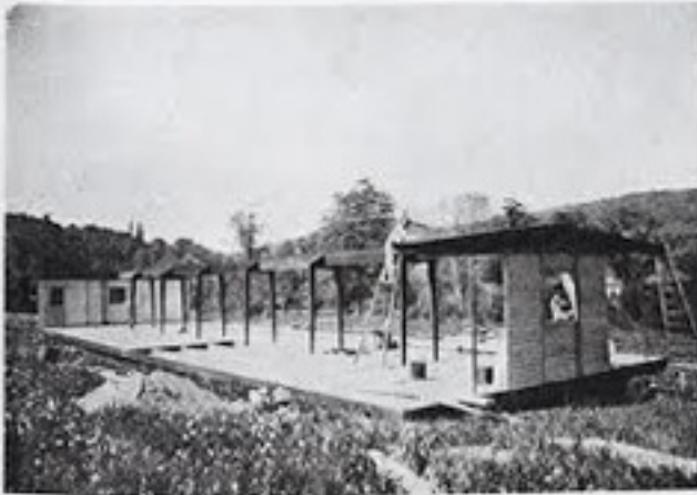
3. VUE D'ENSEMBLE DE L'OSSATURE