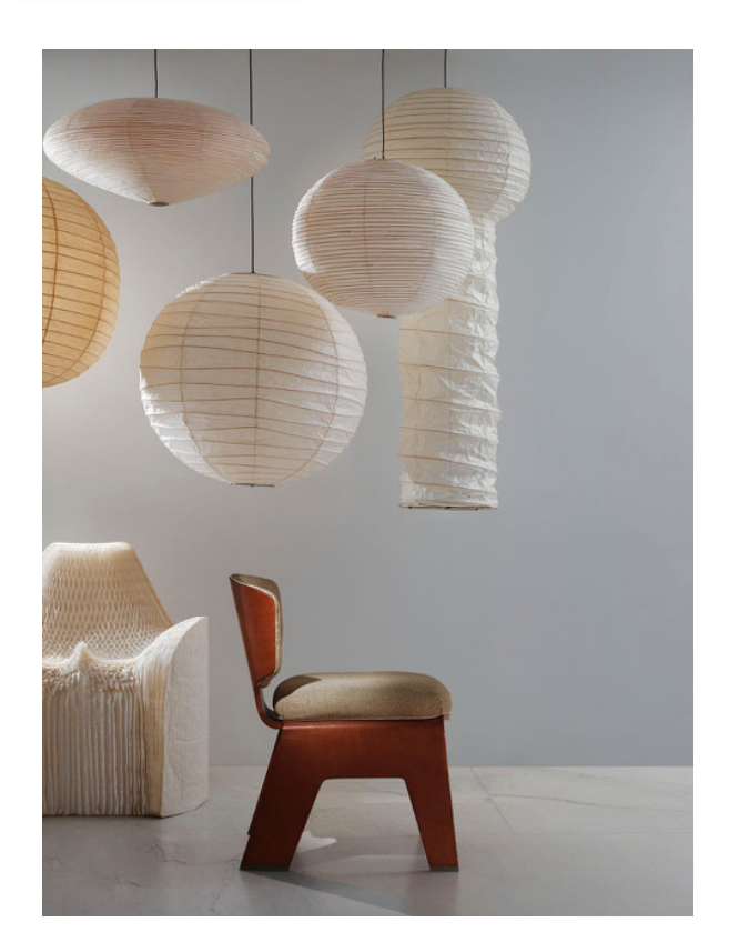
Isamu Noguchi Suspensions 'Akari' ca. 1960-65

Lampshades covered with paper made from the pulp of the Mino (mulberry) tree, ideogram Red sun and moon Published by Ozeki Company, Gifu (Japan)