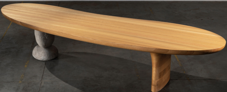
Choi Byung, Hoon Table, 2021.