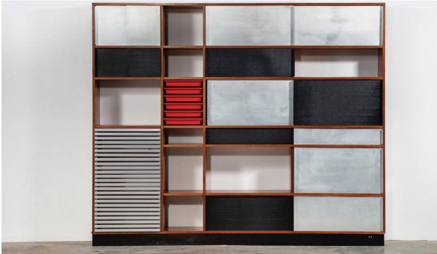
Charlotte Perriand, Storage furniture, ca.1965.

Drawing on its archive of furniture by Charlotte Perriand, Choï Byung Hoo and Pierre Jeanneret