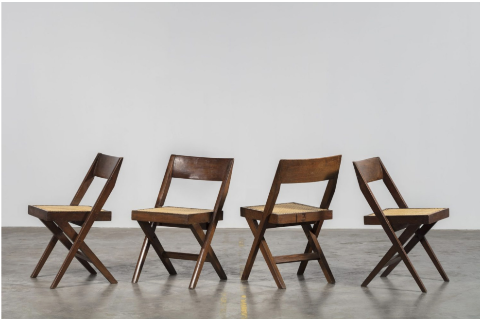
Pierre Jeanneret, Chair called «Library», ca. 1959-60.

Laffanour / Galerie Downtown Paris at PAD, 29 March to 2 April 2023, Stand 1, Jardin des Tuileries, Paris.