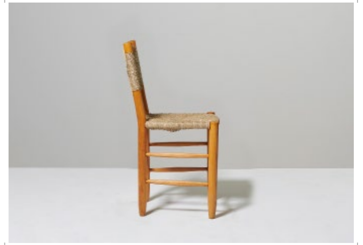
07. Charlotte Perriand