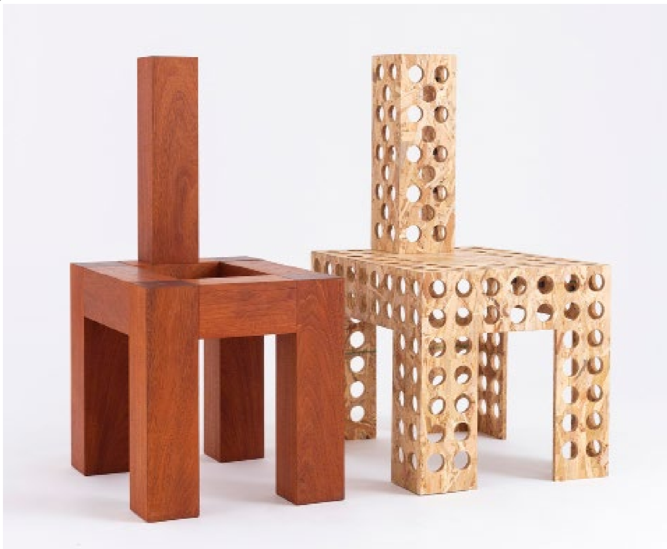
13. Theju Nimmagadda