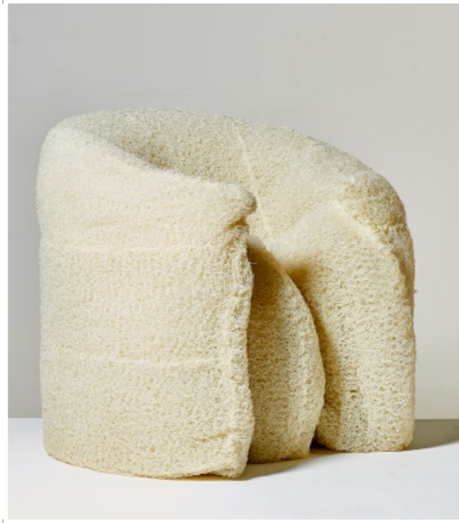
10. Tokujin Yoshioka