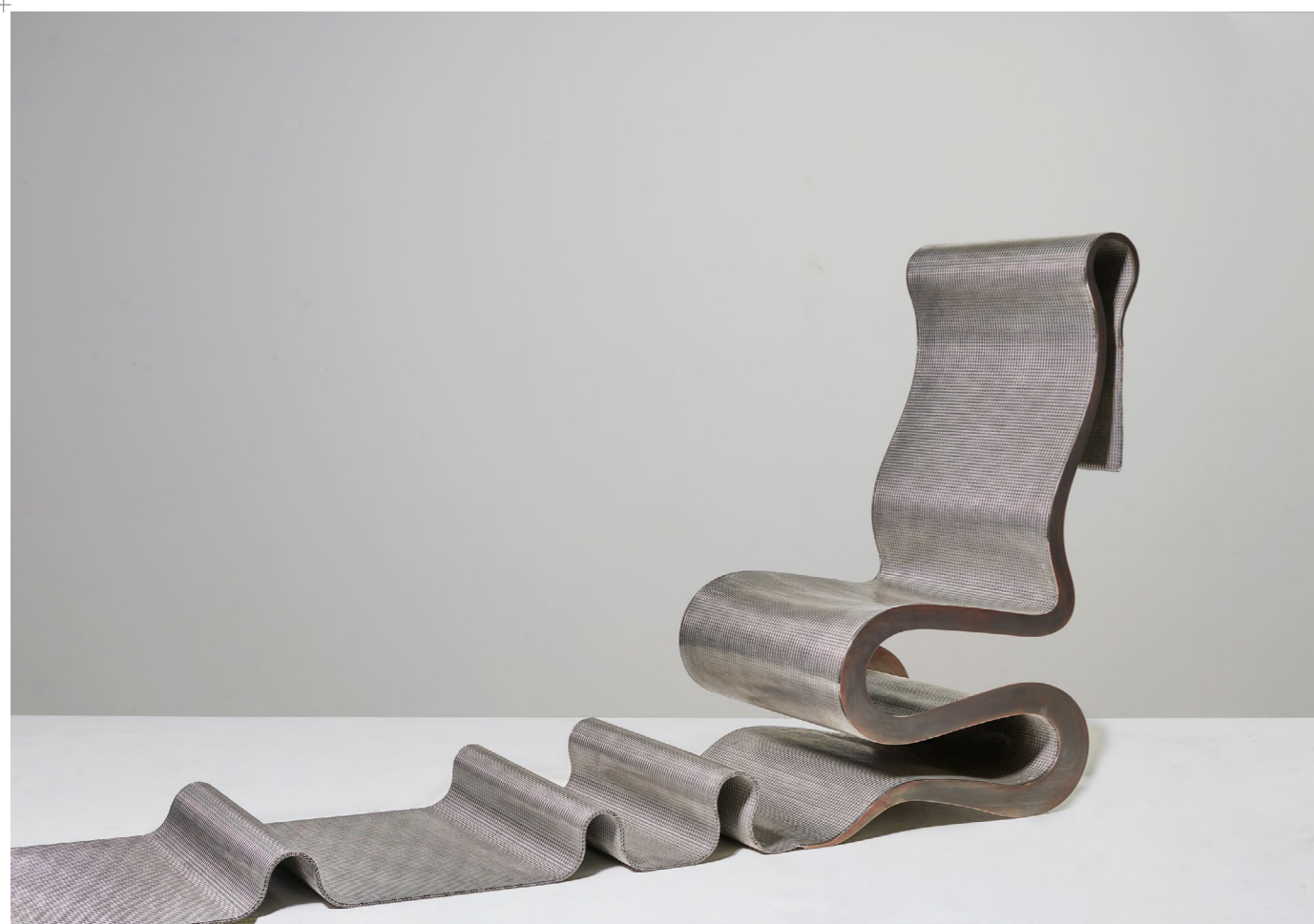
01. Ron Arad