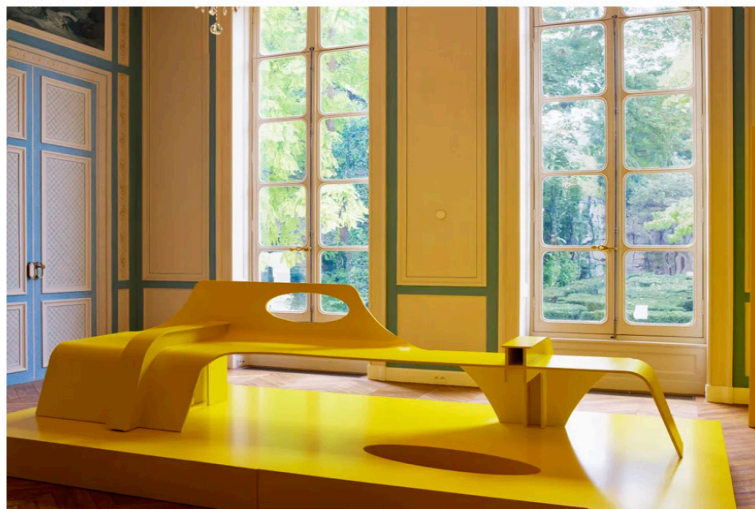
Miami Design District presents Expression. Service. Essence. by Samuel Ross.

collectors. On the main level, they wandered through the enfilade of salons and drawing rooms, past Charlotte Perriand's Mexique bookcase at Jousse Enterprise; onward to the impeccable suite of Jean Royère's Ours Polaire seating in vivid red from Galerie Jacques Lacoste; further beyond to Friedman Benda's sculptural tables from Samuel Ross and Daniel Arsham; finally reaching the future-leaning and gleaming silver furniture by Max Lamb arranged under a Calder mobile at Salon 94 Design.