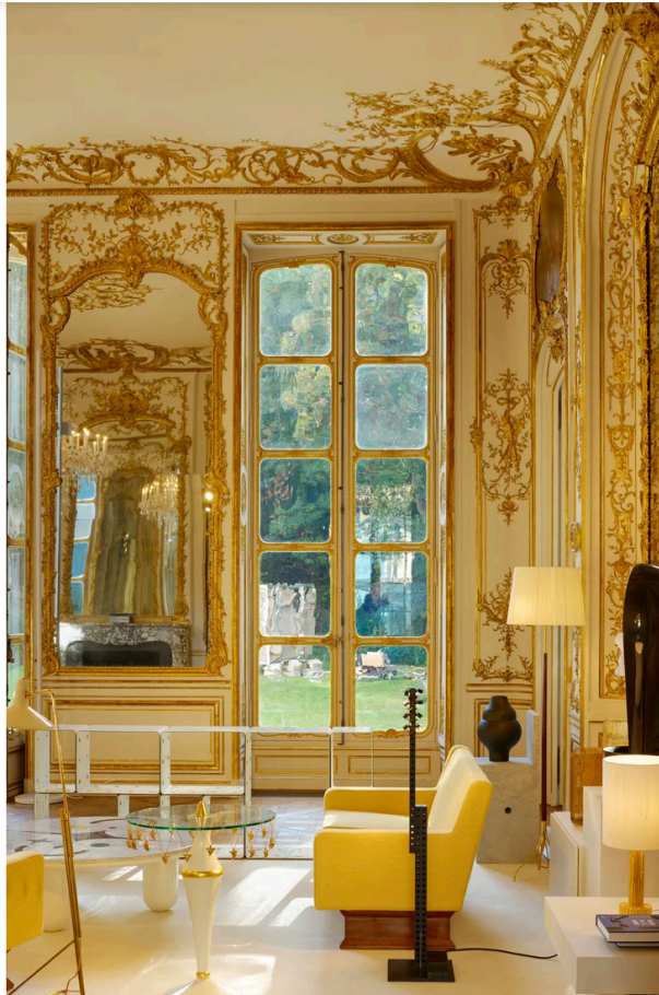
Galerie kreio.