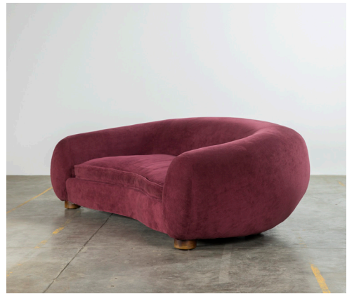
Jean Royère (1902 - 1981) Ours Polaire sofa , ca. 1952