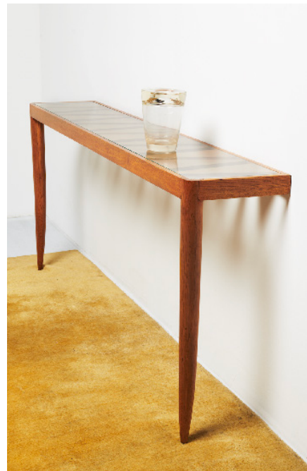
Jean Royère (1902 - 1981) Console , ca. 1955