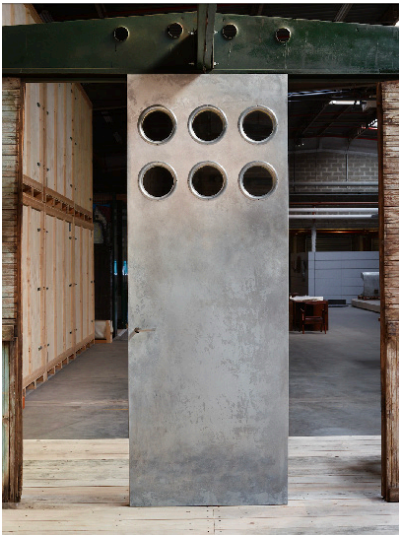
Jean Prouvé (1901 - 1984) Meudon door , ca. 1949

From 10th to 14th May, 2024 643, Park Avenue Armory, 10065 New York Booth 376