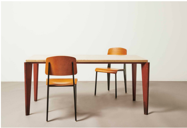
Jean Prouvé (1901 - 1984) Flavigny Table (Granito) , ca. 1945