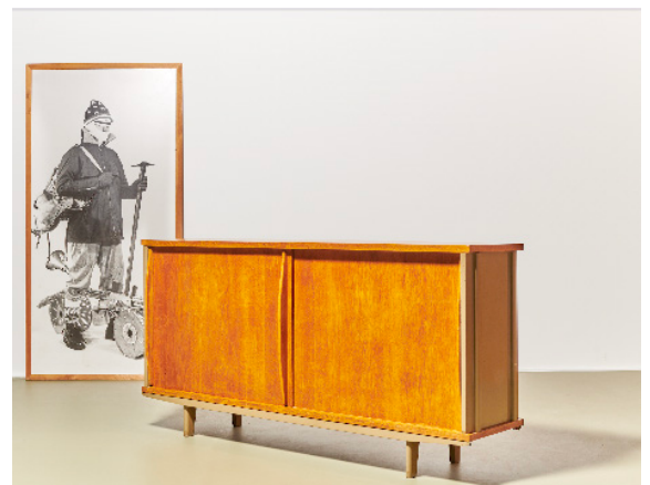
Jean Prouvé (1901 - 1984) Bahut, Model no. 150 , 1952

A modernist sideboard, also by Jean Prouvé, will be presented in New York. The advent of this model of demountable sideboard, designed specifically for the domestic market and mainly dedicated to furnishing emergency housing, is a real feat. Its structure, made from folded and lacquered sheet steel, is both robust and elegant. The two sliding doors and wooden top add to its charm and practicality, making this sideboard a versatile and aesthetic solution to post-war home furnishing needs.