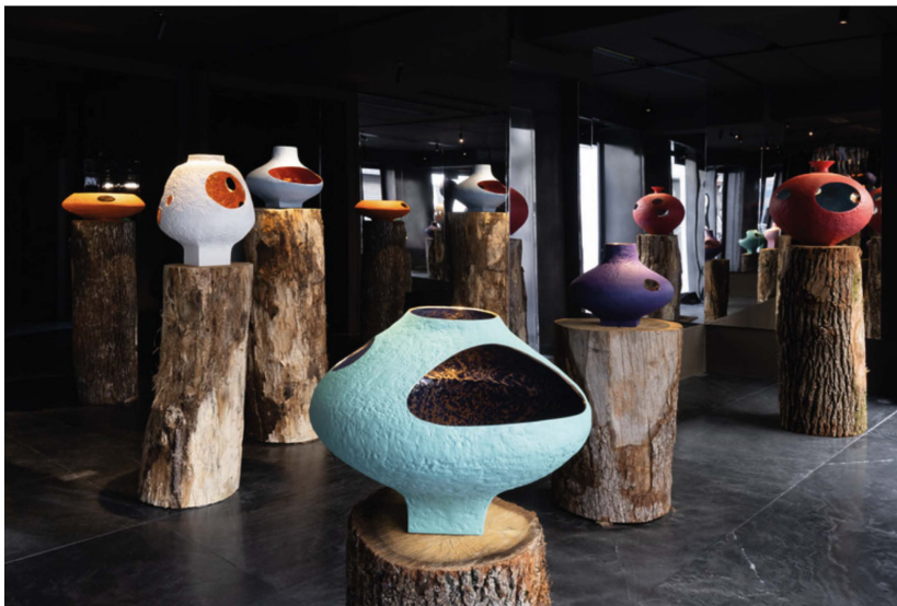
“Nectar Vessels Bronzes.”

That world is one of surprising and sublime beauty. “There are two different stories,” van Assche explains of the multicolor vessels, which are perched curiously on tree trunks. “I wanted to create a moment of quiet, of peace, in the city. With all the mirrors, it becomes a huge forest.” There’s also a trunk where visitors can sit and rest their feet in the leaves. He envisioned the scenography as a dazzling immersion into an imaginary forest of flower vases, but without the flowers.