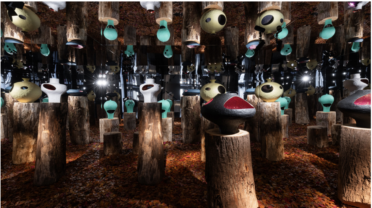
"Nectar Vessels Bronzes."