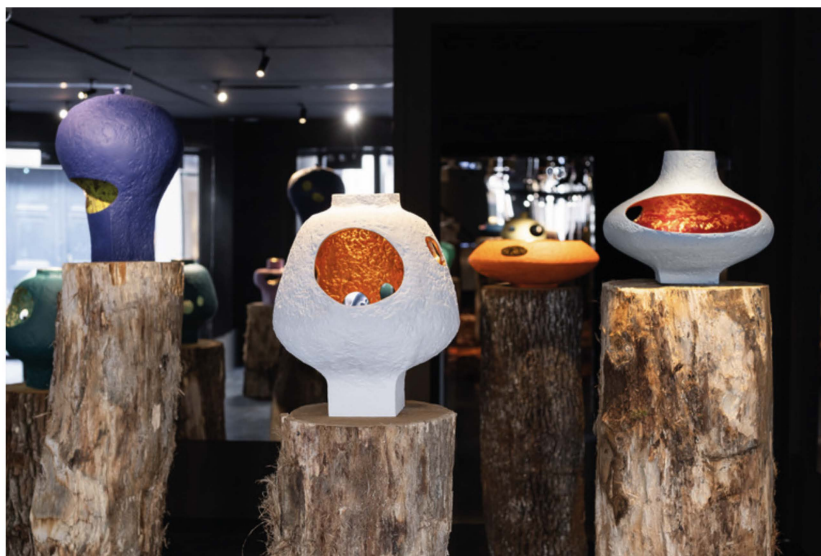
"Nectar Vessels Bronzes."