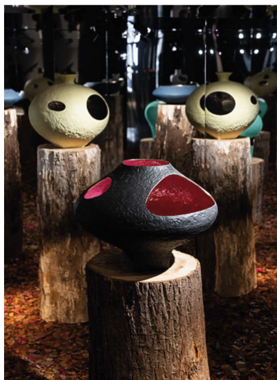
"Nectar Vessels Bronzes."