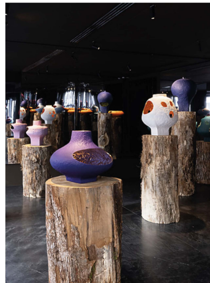
“Nectar Vessels Bronzes.”

Learning about traditional bronze-making techniques—the vases were produced in partnership with the Fodor foundry in Port-sur-Saône—also proved to be a revelation. Each object is coated in a matte, powdery lacquer with contrasting yet complementary shades adorning the polished rose gold interiors, visible via gaping, oversize apertures.