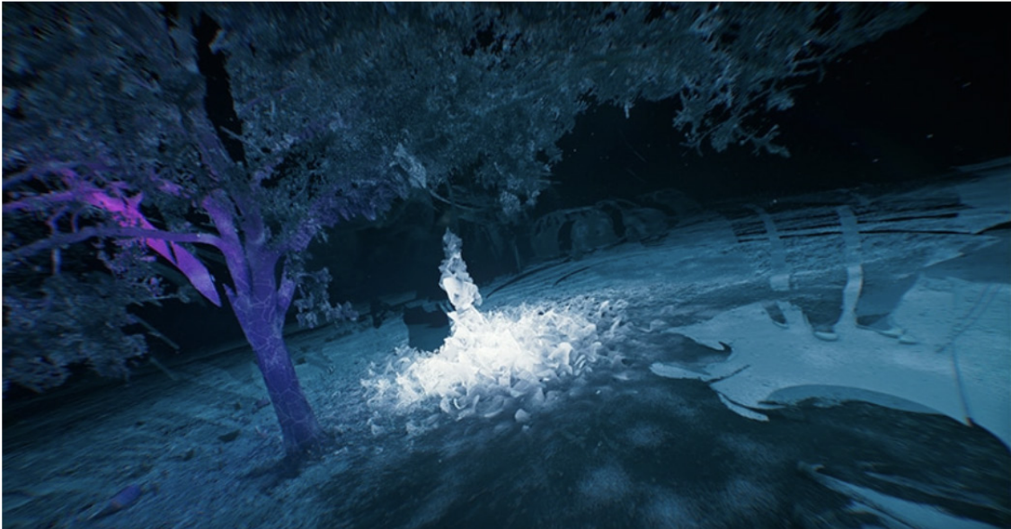
Mohamed Bourouissa, Généalogie de la Violence , Film still, 2024