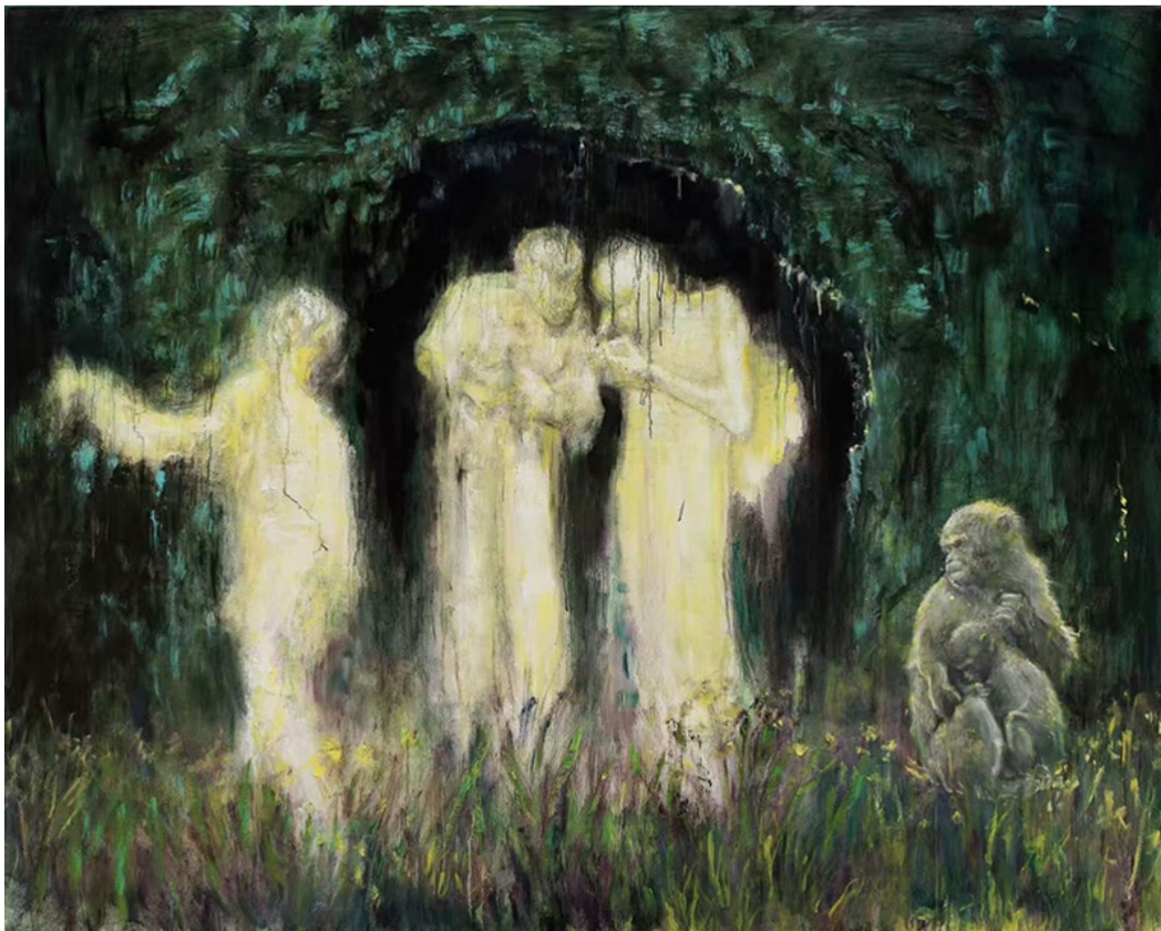
L'antre verte, 2024