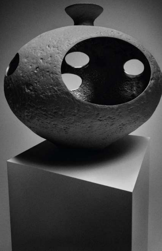
'Bronze 08', 2025

The exhibition also features a new series of black-and-white photographs by Julien Martinez Leclerc , highlighting the sculptural intensity and material depth of the works, while highlighting the tactile and volumetric qualities of bronze.