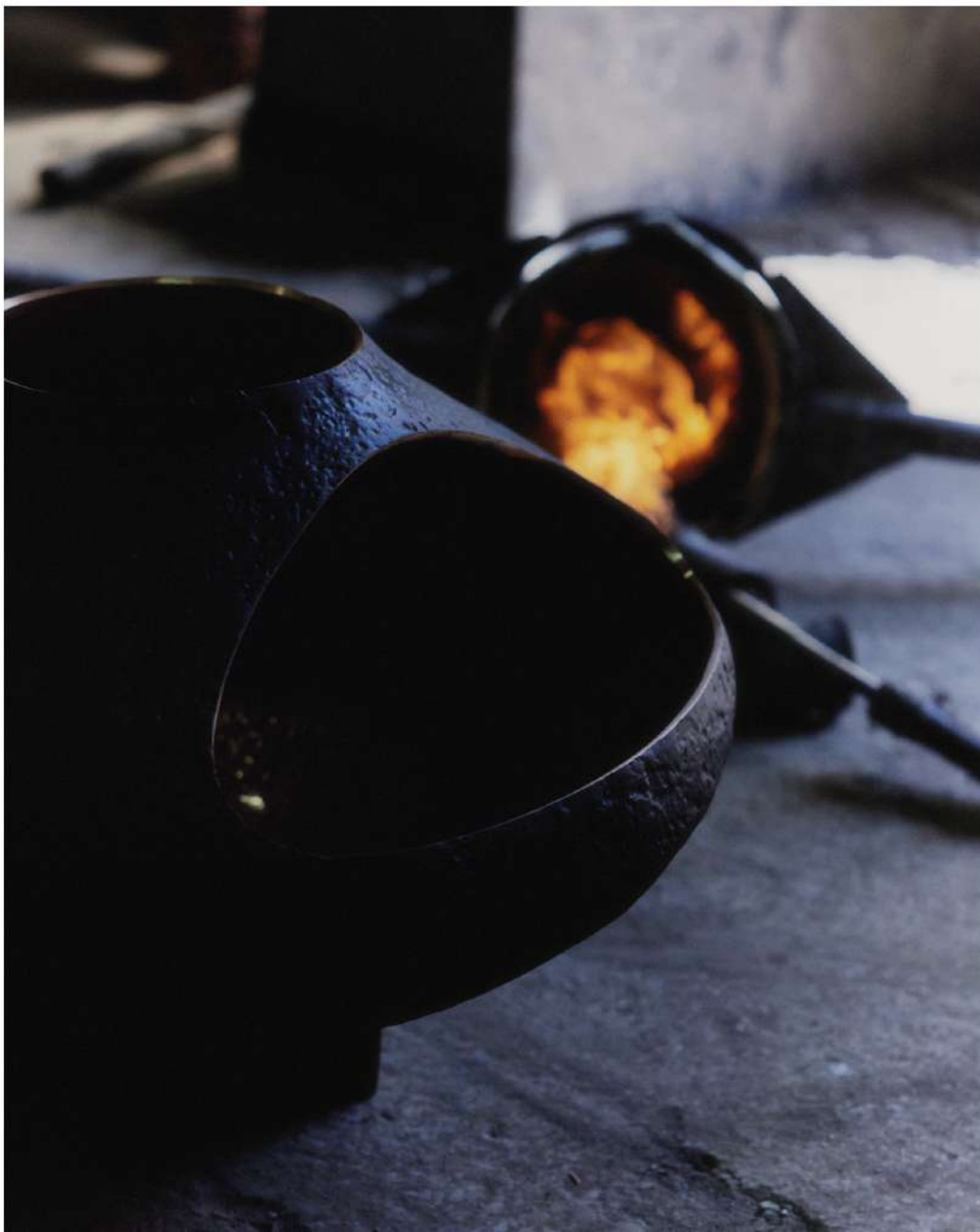
'Bronze 01', 2025

Outside: Black, Inside: Pink Yarrow H. 50 x L. 65 x W. 65 cm